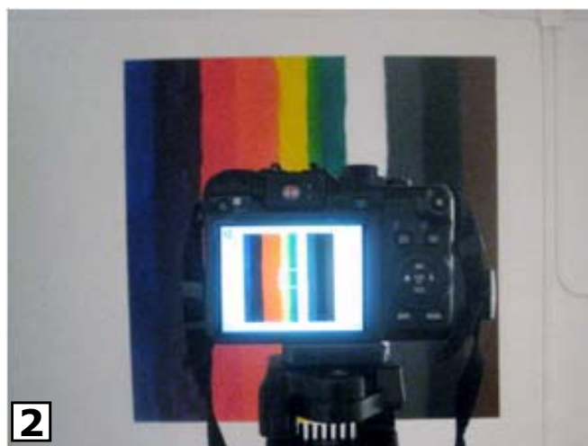
2 i took a picture of the painting.